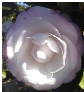
Camellia Japonica 'Desire'