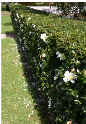
Established hedge of Camellia Sasanqua 'Setsugekka'