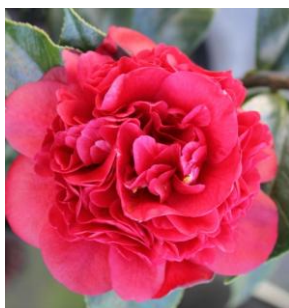
Camellia Japonica 'Takanini'

Camellias generally tolerate full sun, wind and partial shade, but some pale pinks and whites need filtered sunlight and protection.