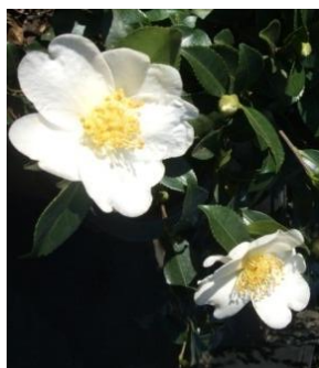
Camellia Sasanqua 'Setsugekka'